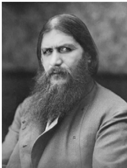
Grigori Rasputin, 1869-1916

In Shakespeare’s Hamlet (yes, Virginia, your humble servant still values The Bard ’s insights), Marcellus notes: “Something is rotten in the State of Denmark.” This oft-quoted observation conveys the notion that a particular situation resembles that of a fish that rots from head to tail, or in other words, it posits that everything is not good at the top of a political hierarchy.